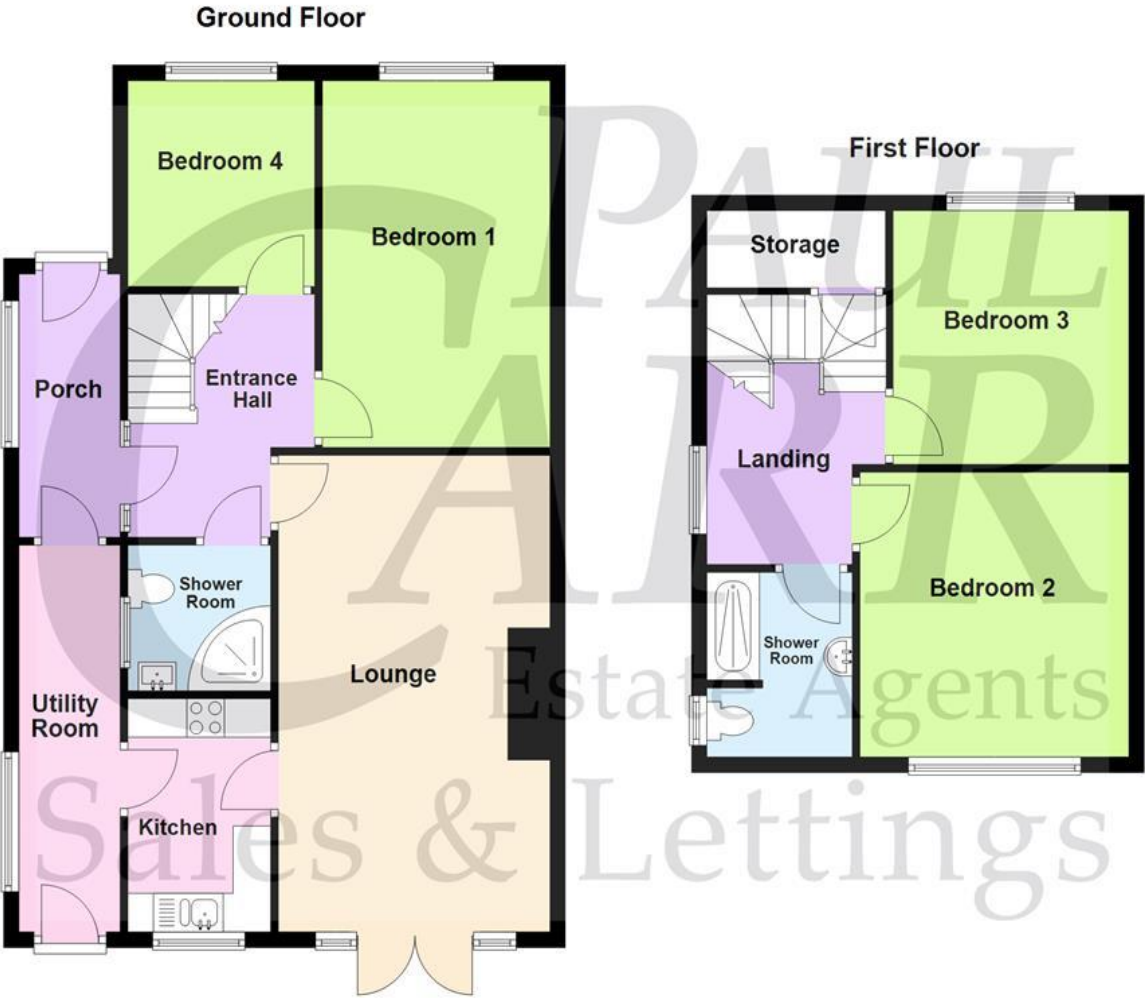
This floorplan is not drawn to scale and is for illustration purposes only Plan produced using PlanUp.

This floor plan is not drawn to scale and is for illustration purposes only